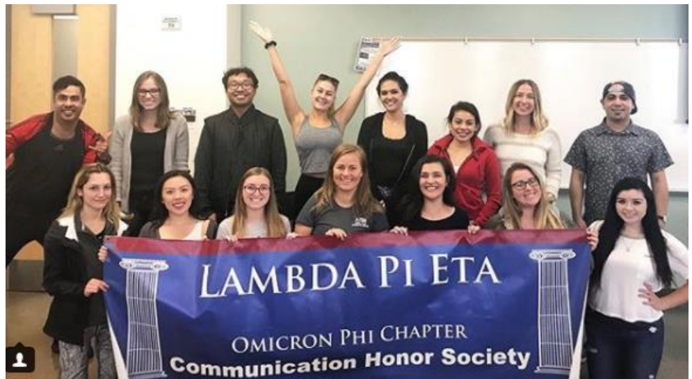
Lambda Pi Eta Spring 2018 Members

Daniels Lab is open Monday – Friday 8:00 Am – 9:00 PM