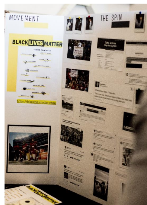
COMM 454 Student Poster from Annual Whiteness Forum

The Whiteness Forum was eye-opening. I appreciated the depth of the conversations, the care that the students took in engaging our world. In the current era – where it's easier to avoid difficult conversations or yell at the person until they back down, it was refreshing to encounter a group that insisted on engaging difficult dialogues.