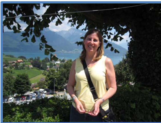
A visit to Spiez in Switzerland