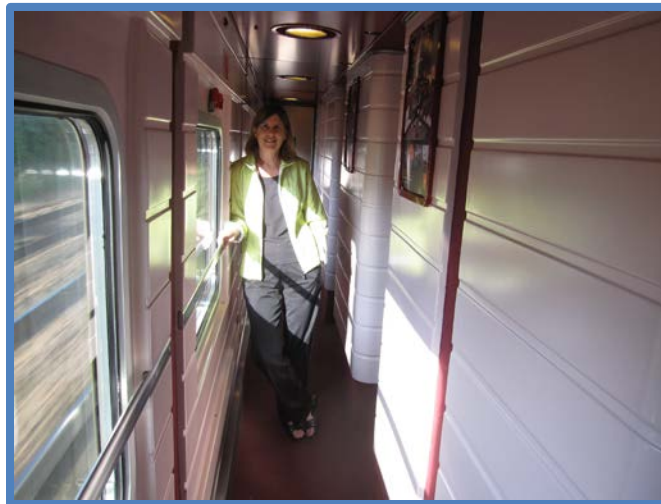
Traveling in the Elipsos Train

Giving up being an active member of my CSUSM community was the hardest part of retirement for me. However, after mourning that impending loss during my last year on campus, I have found that, for me, being retired does indeed mean life on another planet. And on this new planet, life is good and it is full, really good and really full. Daily, I am aware of how fortunate I am to have this privilege of retirement, this privilege of being able to find a balance between breathing and other activities such as more travel, being more politically active, being involved in my broader community motivated by my continued passion for social justice, seeing more of my friends and family here and around the world.