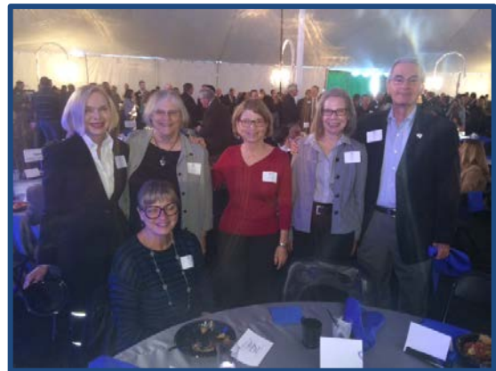
Retirees at the 2015 Report to the Community