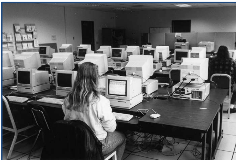
Computer Lab in ACD 202 on campus