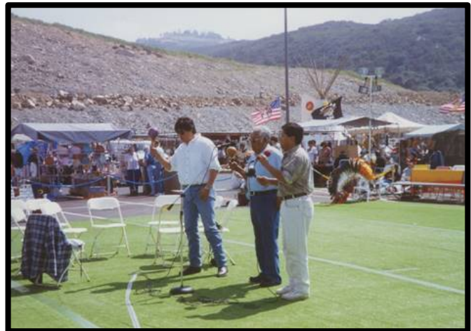
Bird Singers Pow Wow 1993