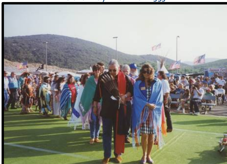
Grand Entry – Pow Wow 1993