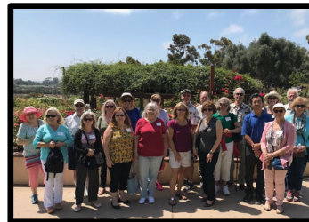
Private tour of Balboa Park on July 26, 2017