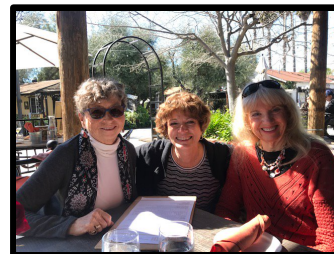
Bernardo Winery on February 19, 2019 It's rough going to a winery as part of my job!