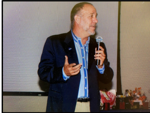
College of Education Alumni event in October 2008