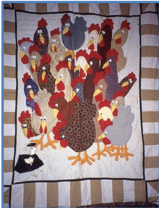
"The Early Bird Gets the Worm"