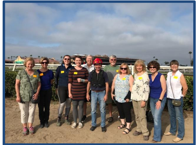
In the middle is Kent Desormeaux, a top jockey!