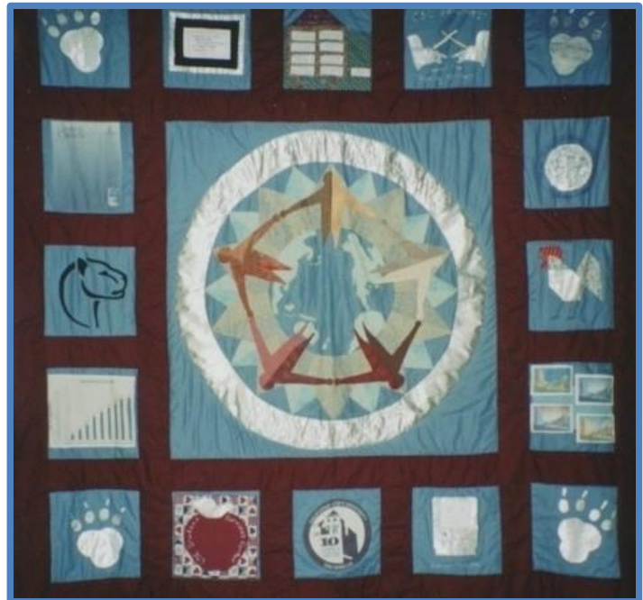
CSUSM 10 th Anniversary