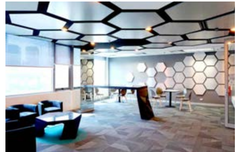
Hanoi City Campus