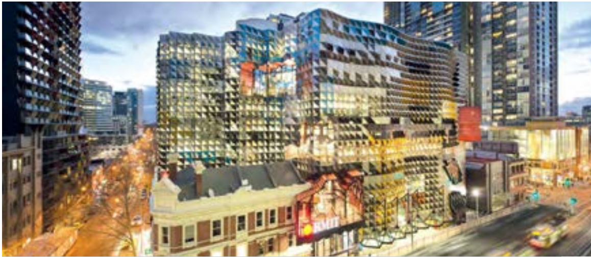
Melbourne City Campus