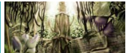
➤ GAME DESIGN