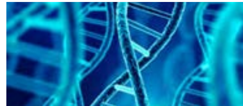
➤ BIOMEDICAL SCIENCES