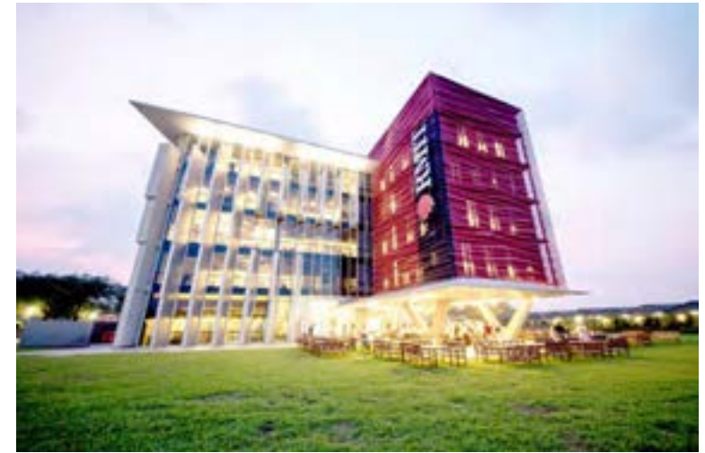
Saigon South Campus