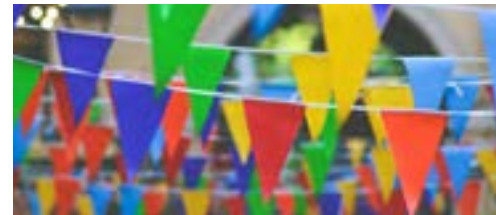
➤ COMMUNITY SERVICES