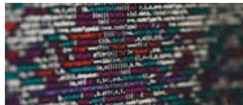
➤ INFORMATION TECHNOLOGY*