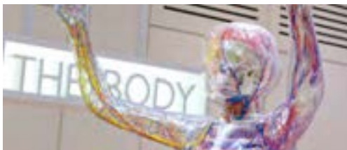
➤ HEALTH SCIENCE