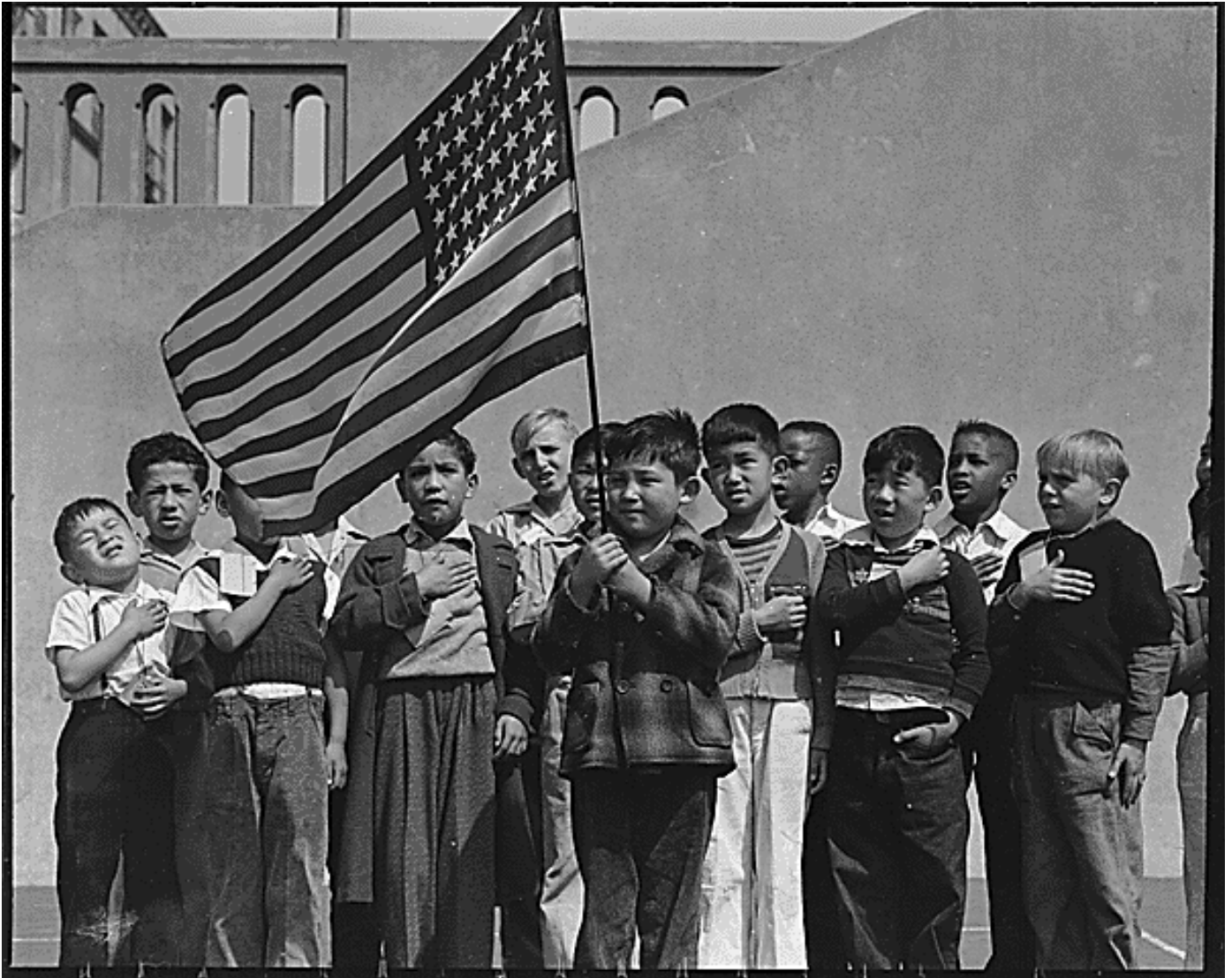
Children pledge allegiance to the flag in San Francisco, California

Key Ideas and Details, Craft and Structure, and Integration of Knowledge and Ideas