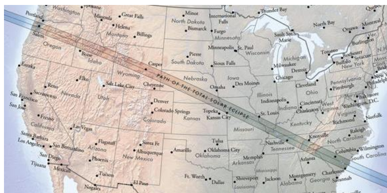
Path of the upcoming solar eclipse

This will be the first time a solar eclipse will be visible in the United States and no other country.