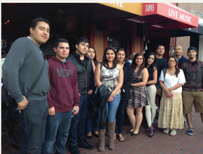
The students gathered outside Café Sevilla.

This spring's cultural event focused on Spanish culture. To that end the TRiO SSS students and staff went to a dinner and floor show at Café Sevilla, in Downtown San Diego. Café Sevilla features an award winning Spanish cuisine. The floor show entertainment was provided by the "Sounds of Sevilla", and featured Flamenco guitarists and dancers.