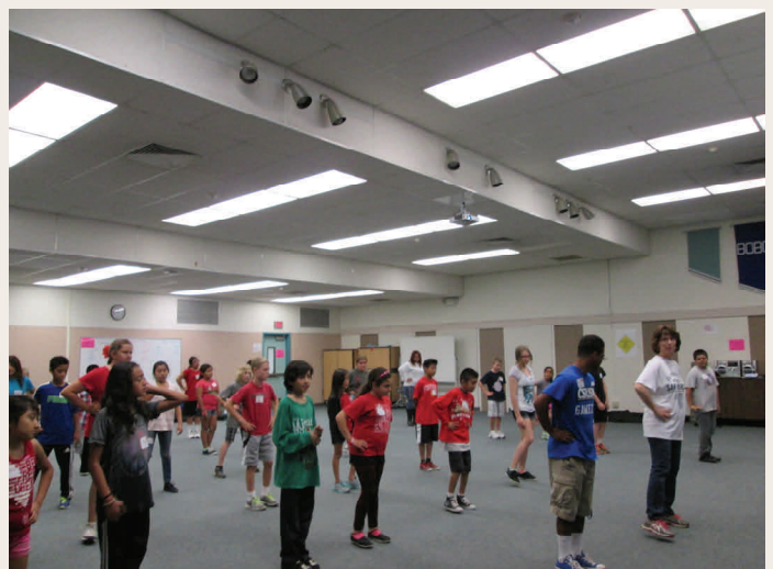
Mrs. Nolan teaching one of the groups of students the step sequence in line dancing.