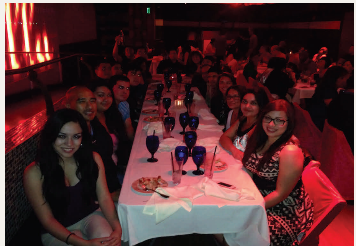
Students and staff enjoying the Café Sevilla's cuisine.