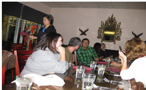
Students and staff enjoyed a scrumptious meal of Thai Cuisine at the Spices Thai Café in Valley Center, San Diego