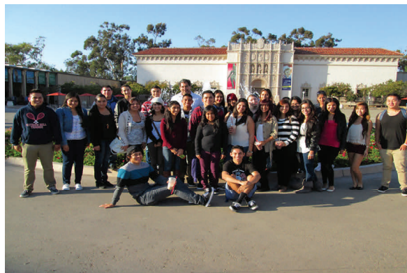
Students in Balboa Park